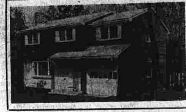
Beechwood at colchester 6 Models from $17,990

Easy Parkway Commuting! Your Present Home Considered In Trade