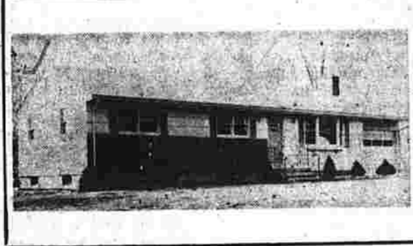
Woodland Heights at vernon 7 Models from $23,900

It offers fine new homes in 10 lovely suburban neighborhoods with easy parking, large wooded lots, and beautiful country views... Ranches, Cape Cods, Raised Ranches, Split Levels, Chalets, Colonials... featuring up to 5 bedrooms, up to 2 1/2 bathrooms, dream kitchens with built-in appliances, formal dining rooms, spacious living rooms, fireplaces, paneled family rooms, 1 or 2 car garages... and so much more!