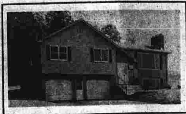
Laurel Heights at vernon 6 Models from $21,600

It offers fine new homes in 10 lovely suburban neighborhoods with easy parking, large wooded lots, and beautiful country views... Ranches, Cape Cods, Raised Ranches, Split Levels, Chalets, Colonials... featuring up to 5 bedrooms, up to 2 1/2 bathrooms, dream kitchens with built-in appliances, formal dining rooms, spacious living rooms, fireplaces, paneled family rooms, 1 or 2 car garages... and so much more!