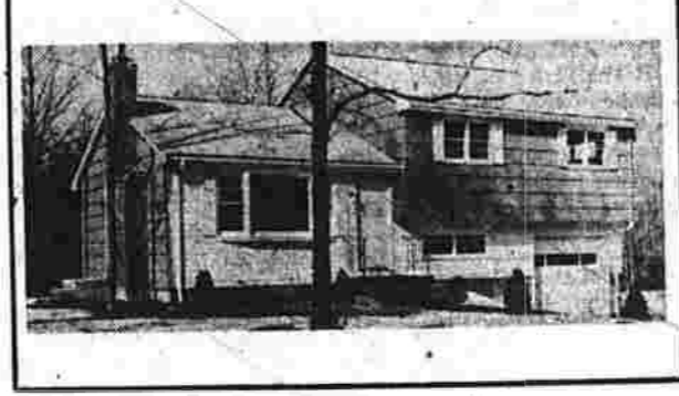
Oakridge at willimantic 6 Models from $17,990

It offers fine new homes in 10 lovely suburban neighborhoods with easy parking, large wooded lots, and beautiful country views... Ranches, Cape Cods, Raised Ranches, Split Levels, Chalets, Colonials... featuring up to 5 bedrooms, up to 2 1/2 bathrooms, dream kitchens with built-in appliances, formal dining rooms, spacious living rooms, fireplaces, paneled family rooms, 1 or 2 car garages... and so much more!