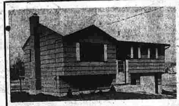
Glenview at tolland 3 Models from $17,990

It offers fine new homes in 10 lovely suburban neighborhoods with easy parking, large wooded lots, and beautiful country views... Ranches, Cape Cods, Raised Ranches, Split Levels, Chalets, Colonials... featuring up to 5 bedrooms, up to 2 1/2 bathrooms, dream kitchens with built-in appliances, formal dining rooms, spacious living rooms, fireplaces, paneled family rooms, 1 or 2 car garages... and so much more!