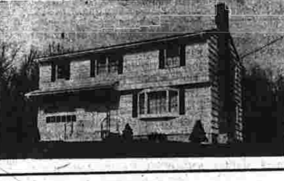
Plazaview at vernon 3 Models from $21,500

It offers fine new homes in 10 lovely suburban neighborhoods with easy parking, large wooded lots, and beautiful country views... Ranches, Cape Cods, Raised Ranches, Split Levels, Chalets, Colonials... featuring up to 5 bedrooms, up to 2 1/2 bathrooms, dream kitchens with built-in appliances, formal dining rooms, spacious living rooms, fireplaces, paneled family rooms, 1 or 2 car garages... and so much more!